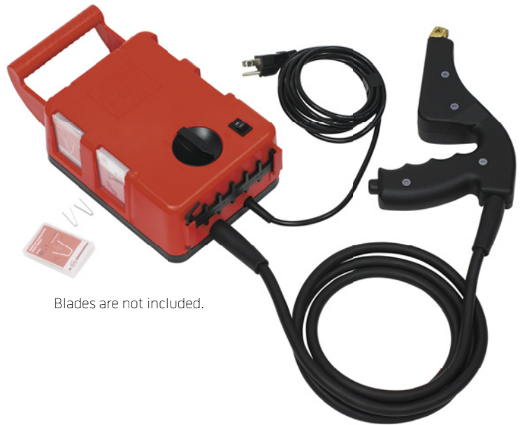
Blades are not included.