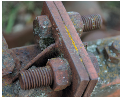
Loosens Rusted Parts