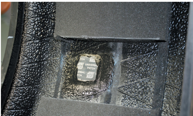
Fig. 4 (2 piece repair)